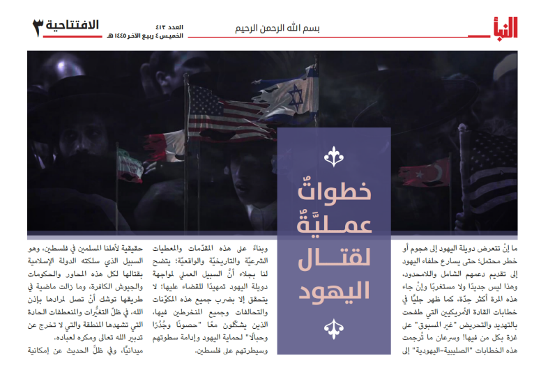
Al Naba's Headline

IS also called Muslims to breach Israel's borders and border protection as well as hit more distant defense line such as the US military installations in the Gulf that protect Israel. Further, it called upon Muslim youth to wear suicide vests once IDF enters Gaza and blow themselves on the Jews on the battleground. At the end of the editorial IS highlighted that the way to topple Israeli is by breaching its border fences as well as what was written in the article and at the end of the day the Jews will experience a true holocaust...¹