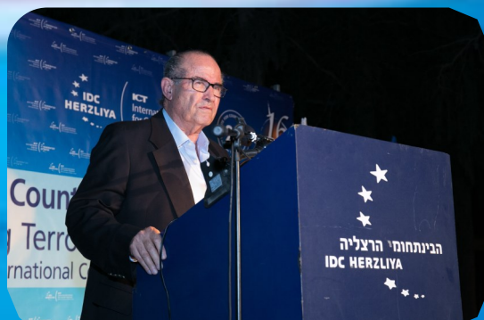
Mr. Shabtai Shavit