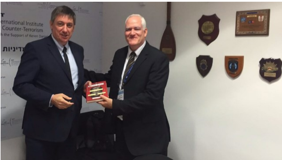
ICT Experts briefed The Honorable Jan Jambon , Deputy Prime Minister and Minister of Security & Home Affairs of Belgium on the threat posed by lone wolves, terrorism in Europe and the protection of critical infrastructure.