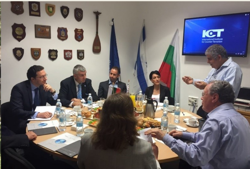
ICT had the pleasure to meet with H.E. Daniel Mitov, Minister of Foreign Affairs of Bulgaria.