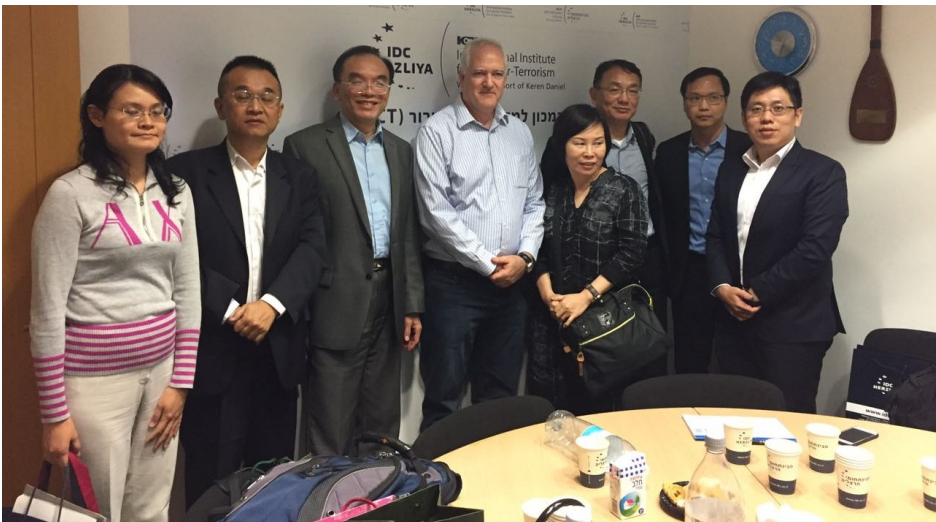
Experts from the ICT met with a delegation from Taiwan and discuss recent terrorism threats to Israel and the region. The delegation included leadership from the Taiwan Office of Homeland Security and the Ministry of Justice Investigation Bureau .