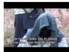
The Belgian Citizen