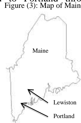
Figure (3): Map of Maine

Somalis are concentrated in Maine's two largest cities: Portland and Lewiston. Maine's first Somalis were those assigned to Portland through American refugee re-settlement programs. These programs place asylum seekers and refugees in various American cities upon arrival to the United States for their first thirty days. The US Department of Health and Human Services then provides recipient states with the necessary funds to assist refugees with housing, employment, and language learning for the subsequent eight months. 27 From that point forward, refugees can continue to receive economic assistance through established charities and state welfare systems.